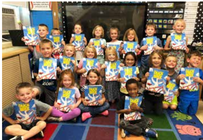
One of our first grade classes love the new book, Duck Bike , you bought for them through the “Book-a-Month” Program.