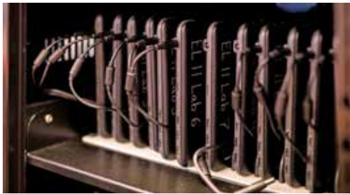
Pictured to the left are High School Chromebooks charging.

Grant Summary: The team's main goal is to build a multi-functional robot for competitive robotics events. So many students, both male and female, are interested in participating that a second competition team has been added. Students use math and computer coding skills, along with tool kits, to create a robot that is maneuverable.