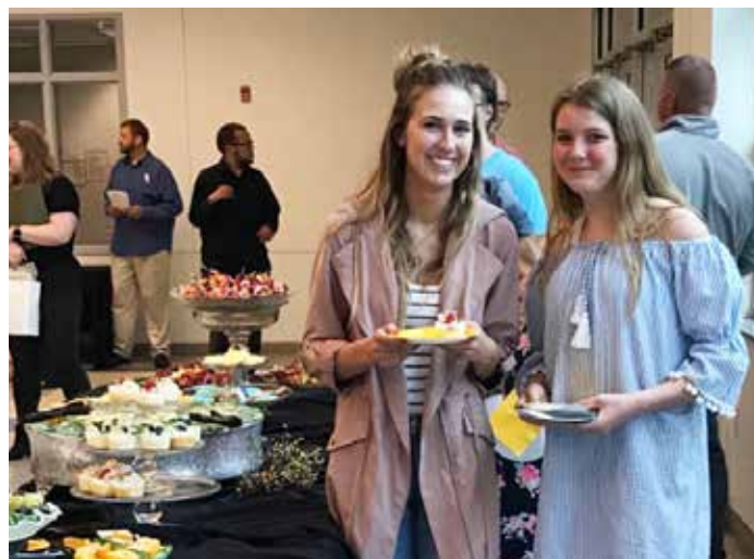
Students enjoy appetizers before the Senior Award Ceremony & Reception.