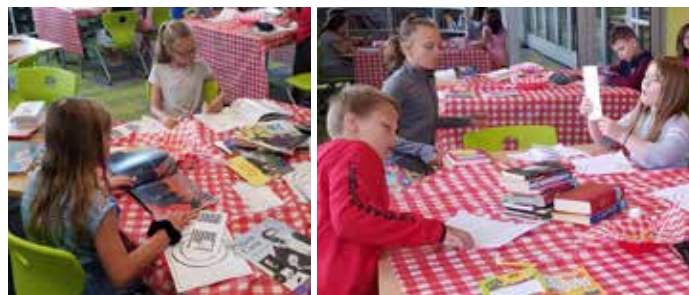
One of our 4th grade teachers opened a book cafe for her students. The teacher served as the chef and the students were provided with different book "tastes" to sample. According to the chef, "just like you should fill and fuel your body with different types of foods, you should fill and fuel your mind with different types of genres! It helps your brain to grow strong, just like food can for your body."