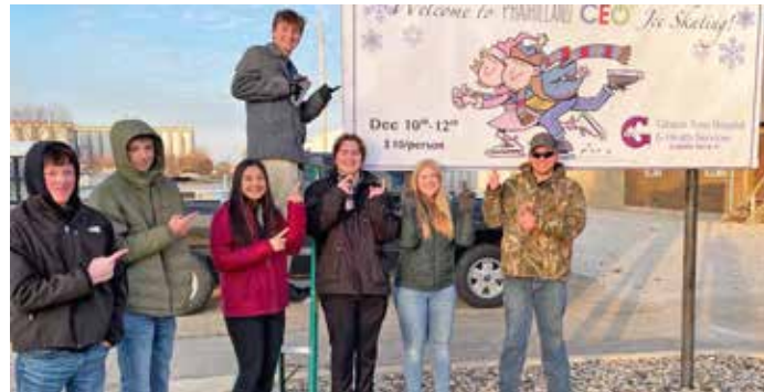
CEO students stand in front of a sign for their class business, an ice skating rink they created in Gibson City.

25% is used by students to start their individual businesses is donated to charity is used towards next year's program is invested in the CEO program