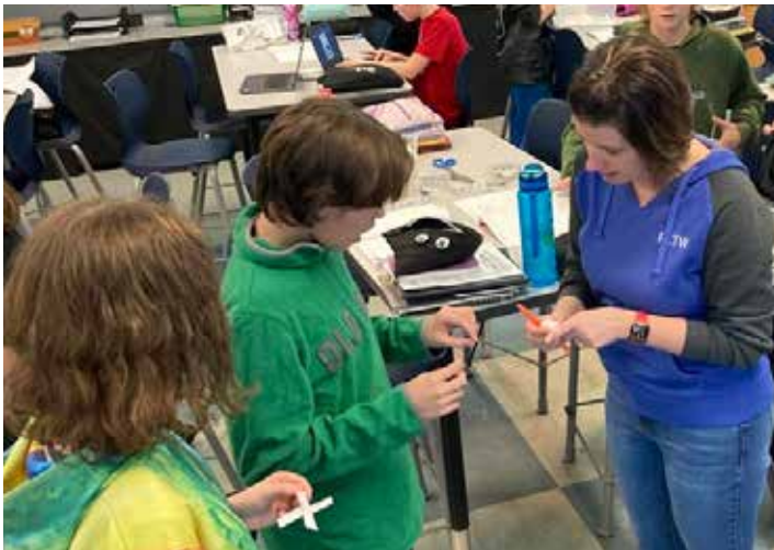
Students design and test models to put learned principles to use.