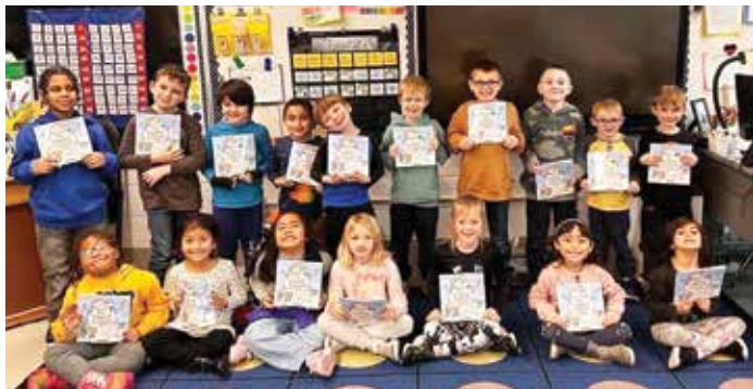
A kindergarten class showing off their book of the month

The PBL Education Foundation believes that reading is the building block for all subject areas. In order to instill a love of reading, students need the opportunity to read. Our libraries do a great job of supplying a variety of reading materials for our students, but the foundation wanted to take it one step further and allow students to grow their own libraries at home.