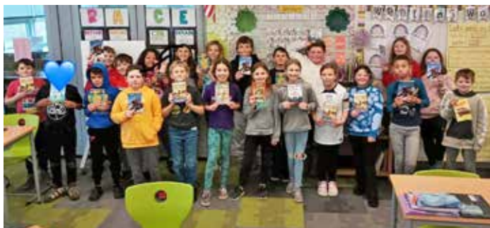
A 4th grade class showing off their book of the month

With your generous donations, the PBL Education Foundation will be able to continue both reading programs for our students. Thank you for helping create lifelong readers!